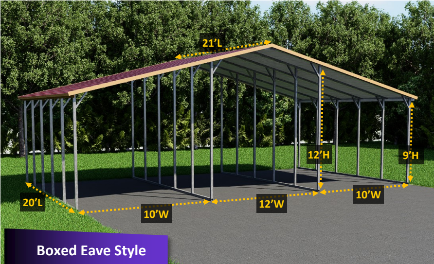
Boxed Eave Style