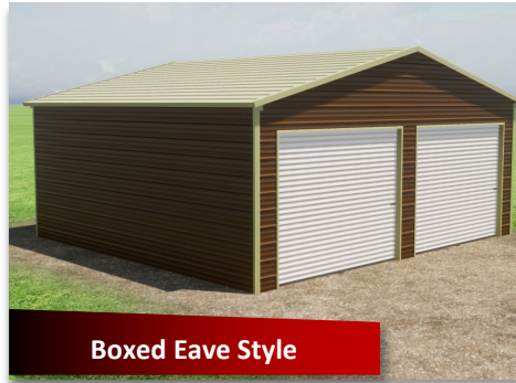
Boxed Eave Style