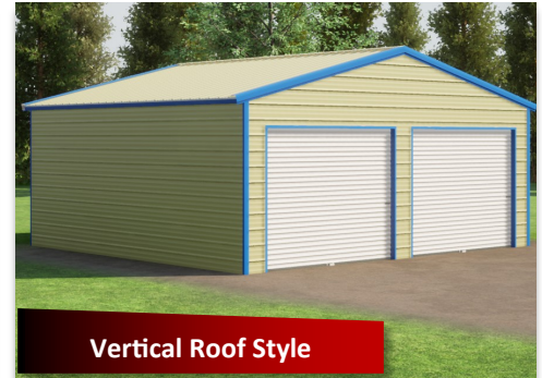
Vertical Roof Style