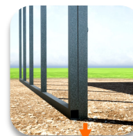
2' Under Ground