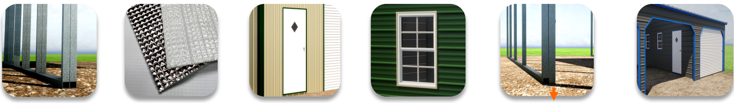
Z Under Ground