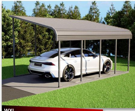
WXL Regular Style