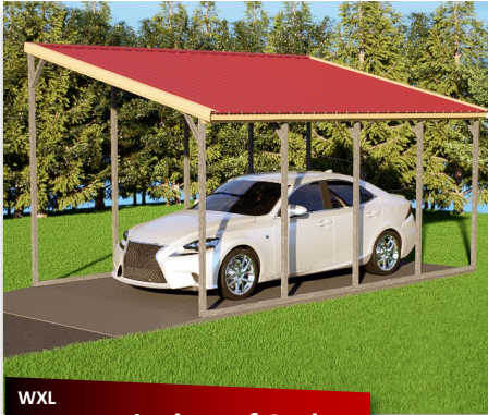
WXL Vertical Roof Style