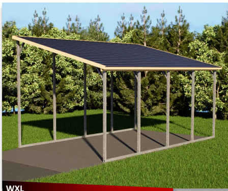
WXL Boxed Eave Style