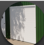
Roll up door