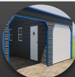
45° Trim Kits