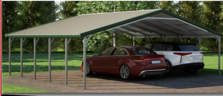
WXL Vertical Roof Style