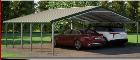
WXL Vertical Roof Style