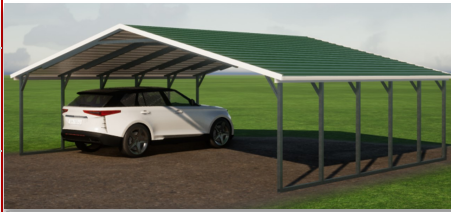
WXL Boxed Eave Style