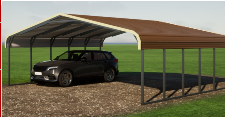
WXL Regular Style