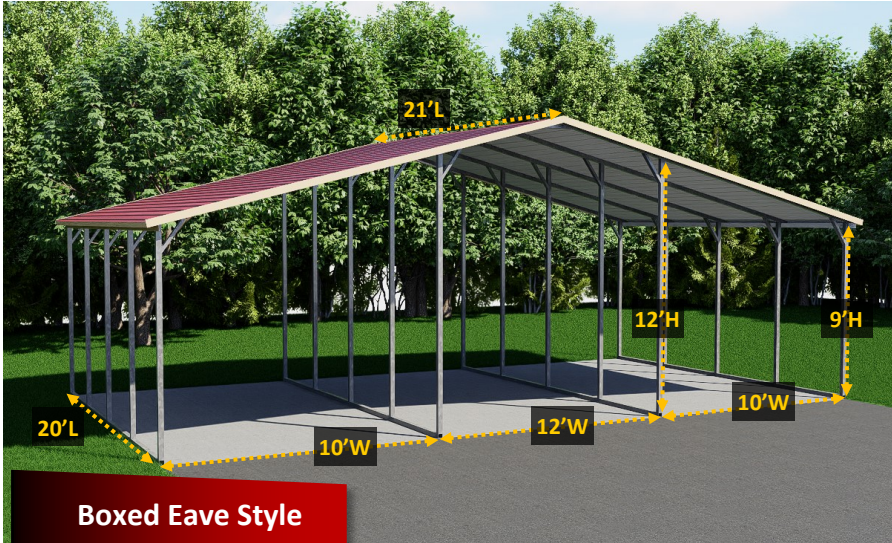
Boxed Eave Style