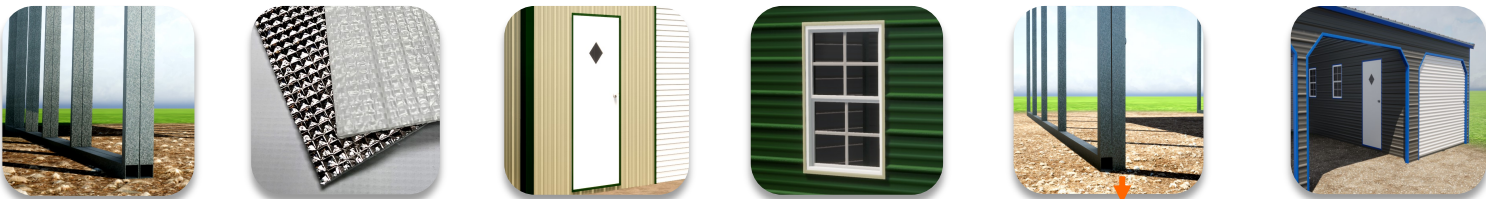
Z Under Ground