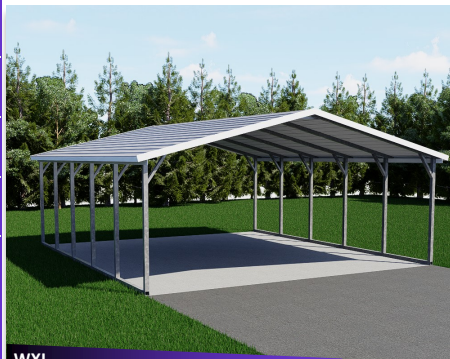
WXL Boxed Eave Style

BOXED EAVE HAS 6" ROOF OVERHANG ON FRONT, BACK AND SIDE EAVES.