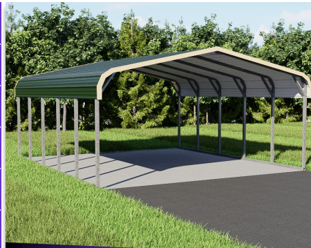
WXL Regular Style

REGULAR STYLE HAS 6" ROOF OVERHANG ON FRONT AND BACK.