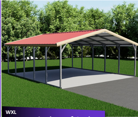
WXL Vertical Roof Style

VERTICAL ROOF HAS NO OVERHANG ON FRONT OR BACK JUST ON SIDE EAVES.