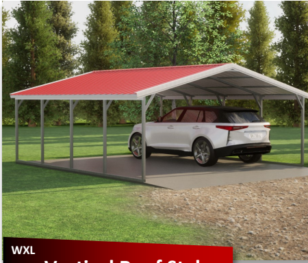
WXL Vertical Roof Style

VERTICAL ROOF HAS NO OVERHANG ON FRONT OR BACK JUST ON SIDE EAVES.