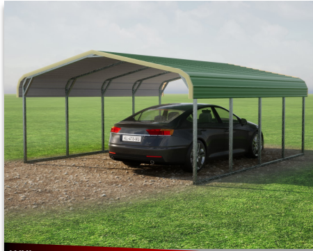
WXL Regular Style

REGULAR STYLE HAS 6" ROOF OVERHANG ON FRONT AND BACK.