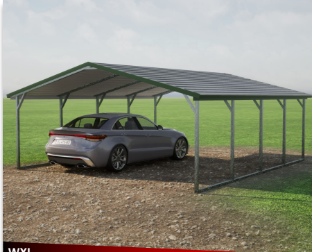
WXL Boxed Eave Style

BOXED EAVE HAS 6" ROOF OVERHANG ON FRONT, BACK AND SIDE EAVES.