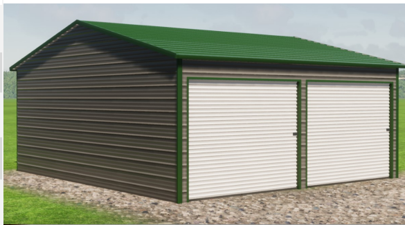
Boxed Eave Style

BOXED EAVE HAS 6" ROOF OVERHANG ON FRONT, BACK AND SIDE EAVES.