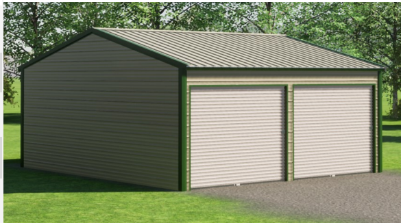
Vertical Roof Style

VERTICAL ROOF HAS NO OVERHANG ON FRONT OR BACK JUST ON SIDE EAVES.