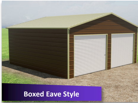
Boxed Eave Style