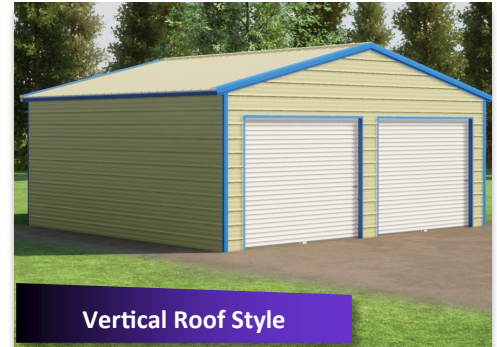
Vertical Roof Style